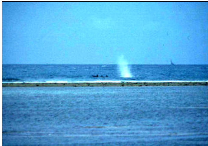
Figure 3: Blasting coral with dynamite.