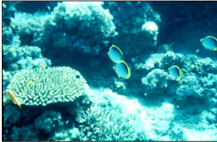
Figure 2: Healthy coral.