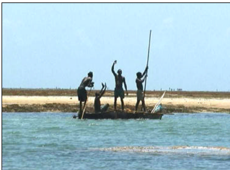
Figure 5: Fishing using traditional methods and equipment.

Destruction of habitats by humans, particularly through indiscriminate mangrove cutting, also has a negative influence on fisheries resources.