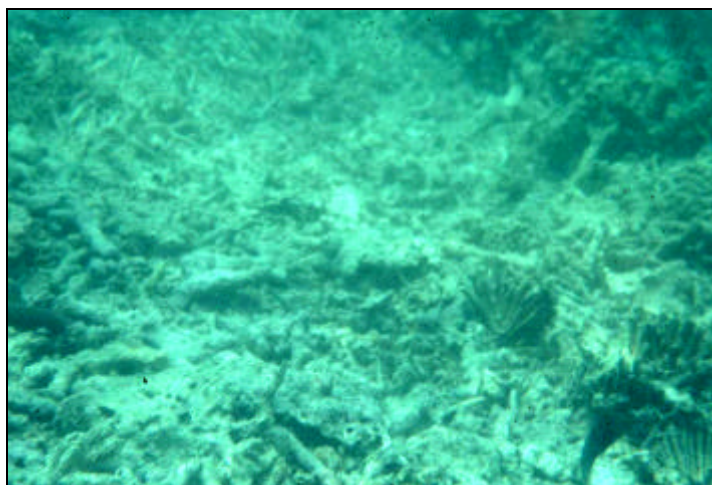
Figure 4: Coral after blasting.